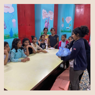
At an Institution