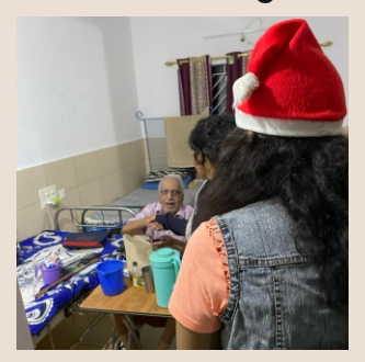
With senior citizens