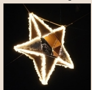
The Beautiful Star!