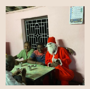
At the cafe