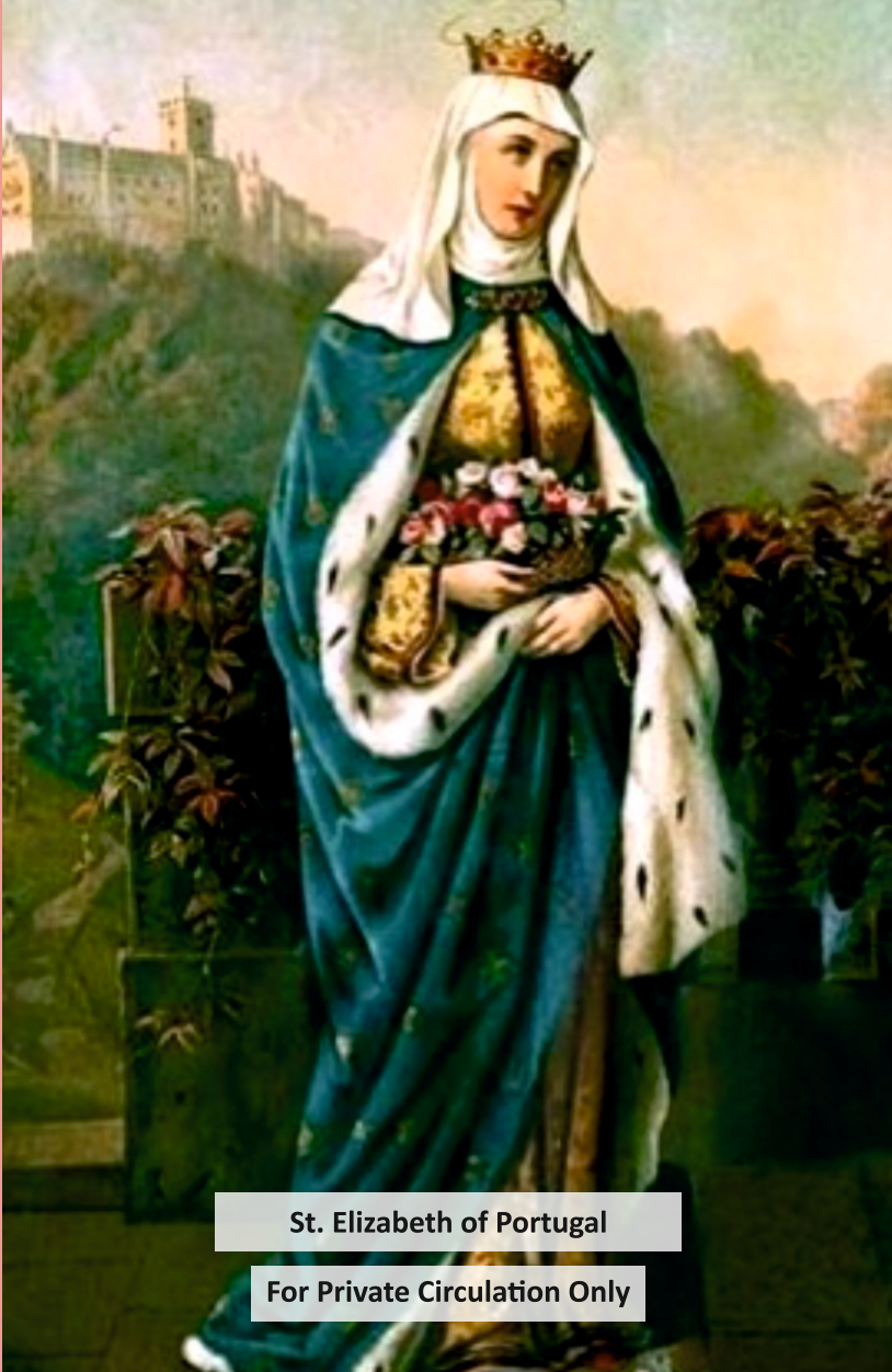
St. Elizabeth of Portugal

St. Elizabeth's Church, Ucassaim, Bardez, Goa 403507